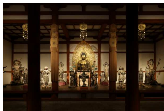
Hall where concert will be held (image)

This is an entrance ticket with harp concert only. Please go to temple by yourselves (5 min walk from Kintetsu-Nara station). We will gladly to arrange a day trip to Nara with English-speaking guide and private vehicle as well. Please feel free to contact us.